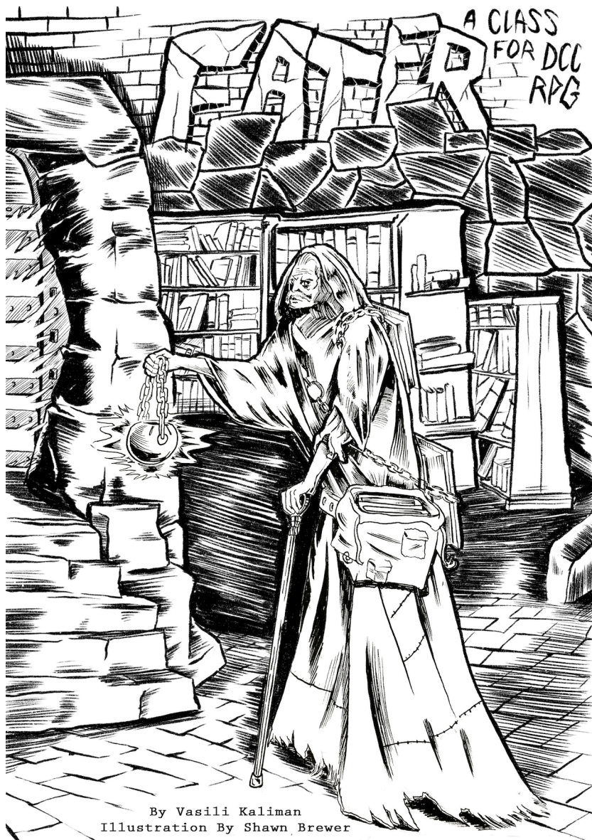
By Vasili Kaliman Illustration By Shawn Brewer

Faters are hermits, thinkers, skeptics and philosophers. They value knowledge, logic and reason above all things. Un beholden to gods, they reject the idea of the spiritual and supernatural, believing instead there is nothing beyond the world of Áreth. To the Fater, magic and the forces of darkness are susceptible to discoverable laws, and the explanations for the mysteries of the universe are ultimately knowable. Although most men are inevitably doomed to